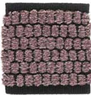
Rose Quartz 66