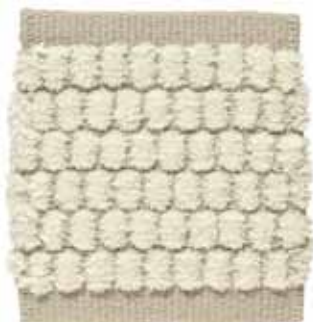
White Pearl 80