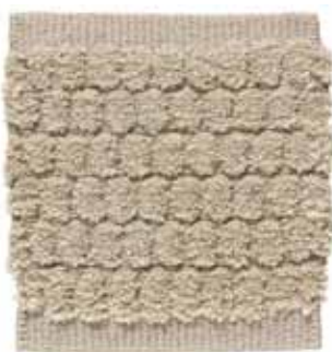
Champagne Citrine 86