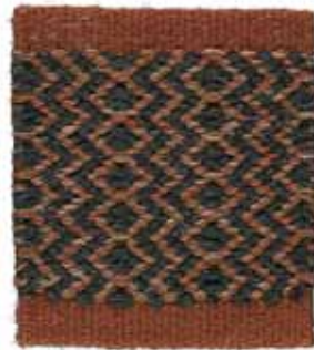
Fox Brown 7001