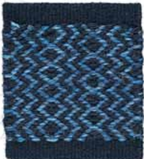
Jeans Blue 2001