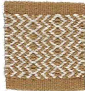
Camel Beige 8001