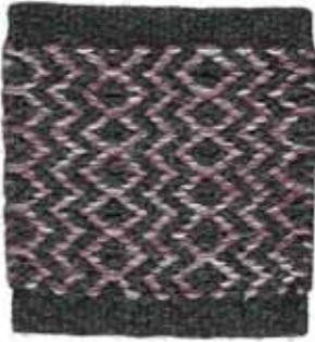
Heather Grey 6201