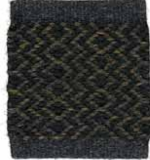
Black Olive 5001