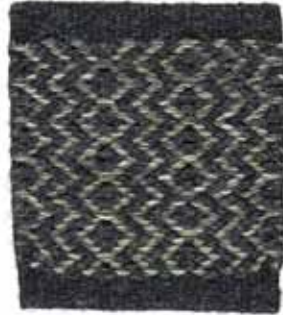
Slate Grey 5002