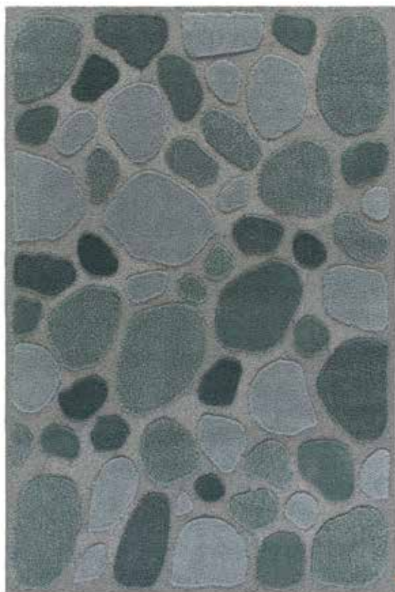
Rug 170x240 cm, March 200