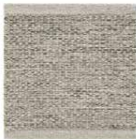
Pebble Grey Silver 502S