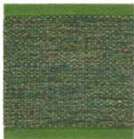
Green Gold 300G