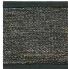
Mountain Lake Silver 202S