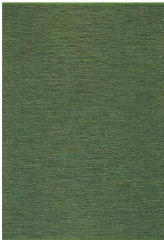
Rug 170x240 cm, Green Gold 300G