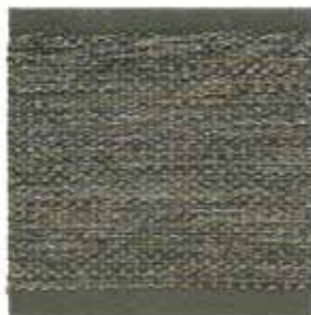
Sage Silver 301S