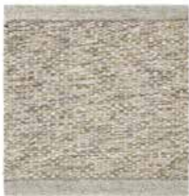
Marble Gold 802G

Design GUNILLA LAGERHEM ULLBERG Woven rug in pure wool and Lurex