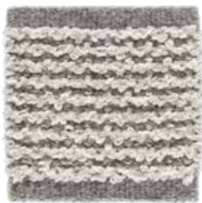
Earl Grey 501