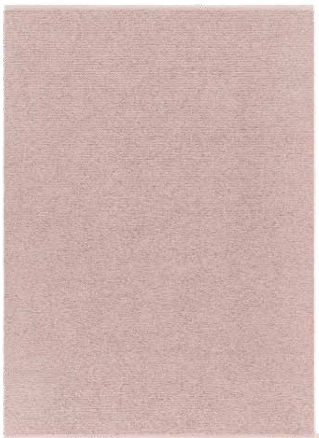
Rug 200x300 cm, Pink Macaron 610