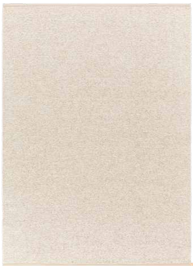
Rug 200x300 cm, Meringue 880