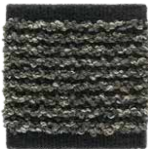
Black tea 500