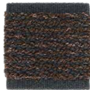
Chocolate Brown 700