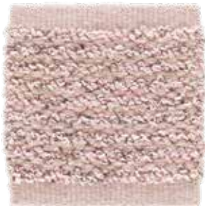
Pink Macaron 610