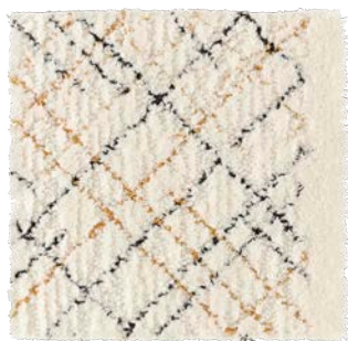
White Diamond 500