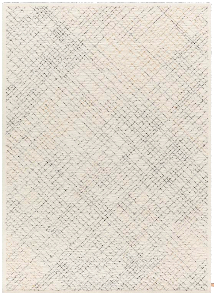
Rug 200x300 cm, White Diamond 500