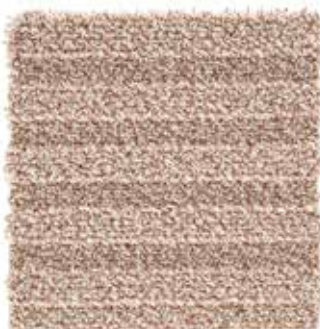
Porcelain Pink 600