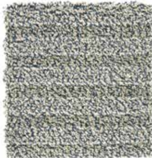
Paris Blue 200