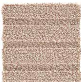
Porcelain Pink 600