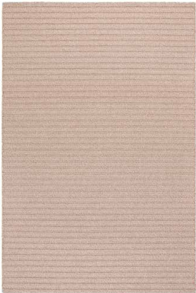
Rug 170x240 cm, Small, Porcelain Pink 600

Design KASTHALL DESIGN STUDIO Hand tufted bouclé rug in pure wool