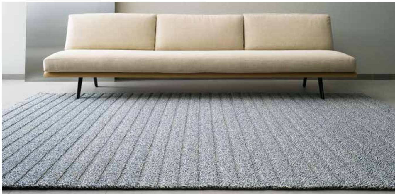
Rug 170x240 cm, Medium, Paris Blue 200