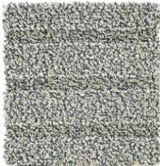
Paris Blue 200