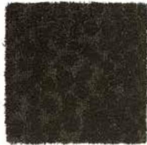
Mocca Brown Patina 804