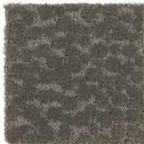
Seal Grey Patina 505