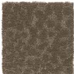
Taupe Patina 803