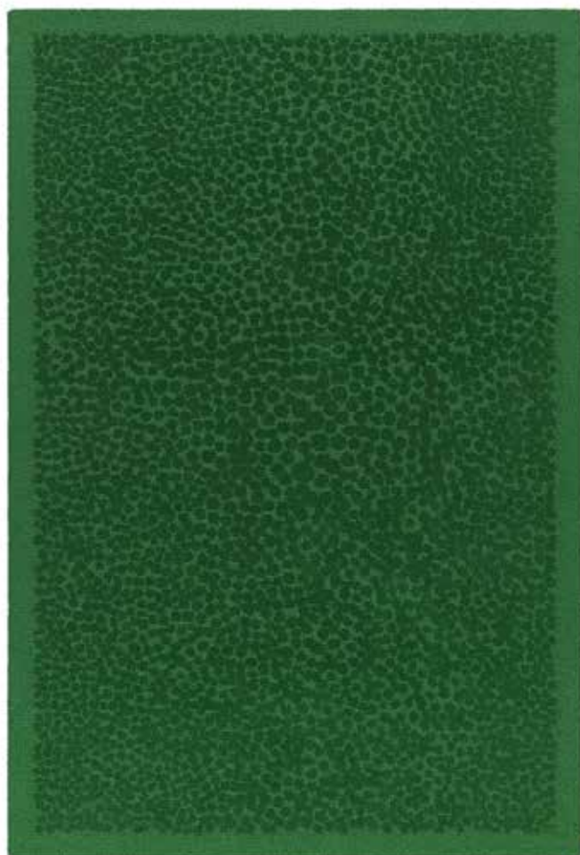
Rug 170 x 240 cm, Emerald Green Patina 301

Showrooms in MILAN | NEW YORK | STOCKHOLM | GOTHENBURG