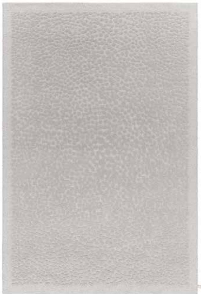
Rug 170 x 240 cm, Light Grey Patina 504