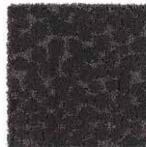
Marbel Grey Patina 501