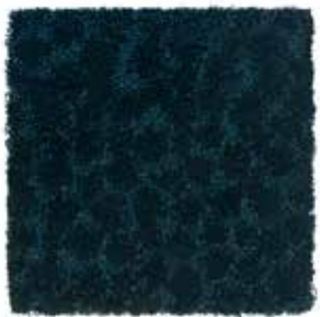
Peacock Patina 201