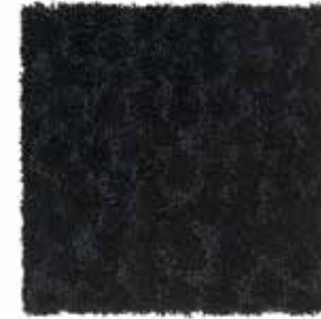
Midnight Black Patina 500

Showrooms in MILAN | NEW YORK | STOCKHOLM | GOTHENBURG