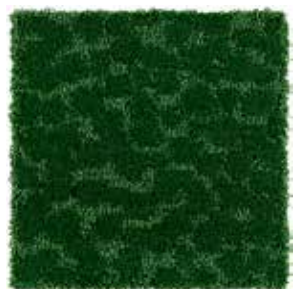
Emerald Green Patina 301