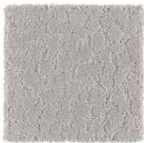
Light Grey Patina 504