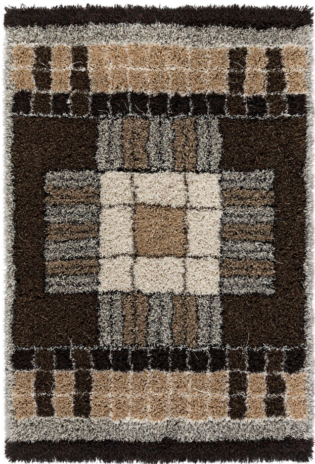
Rug 200x300 cm

Design INGRID DESSAU Hand tufted rug in pure wool and linen