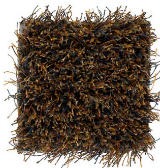
Copper Blue 820