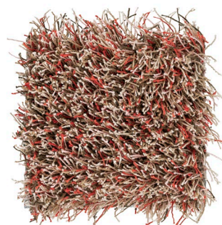
Almond Blush 810