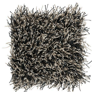
Mottled Black 580