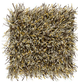
Lemon Fudge 840