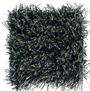
Ink Blue 521