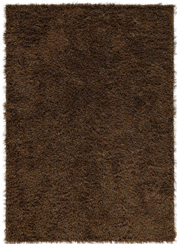
Rug 170x240 cm, Copper Blue 820