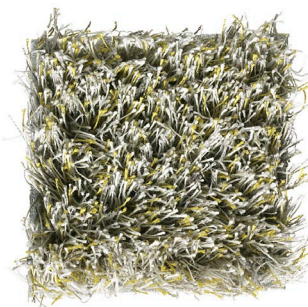
Grey Yellow 10