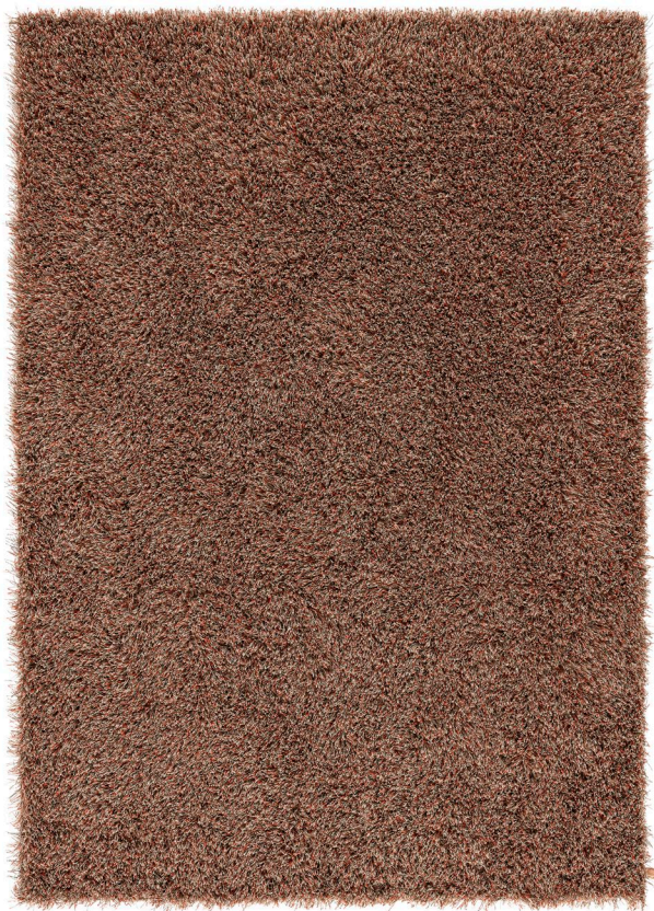
Rug 170x240 cm, Almond Blush 810