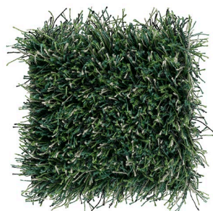
Sea Green 350