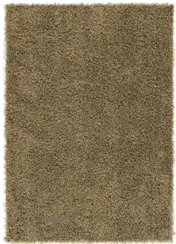
Rug 170x240 cm, Lemon Fudge 840