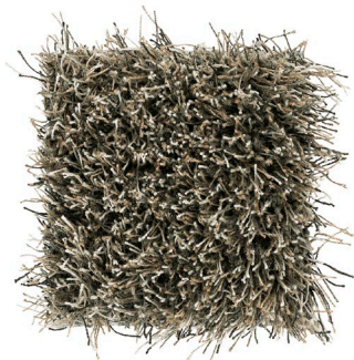
Lunar Beige 870