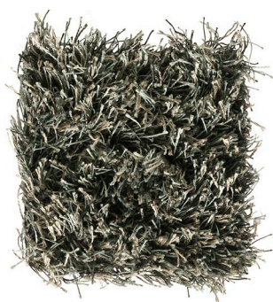
Dark Grey 1