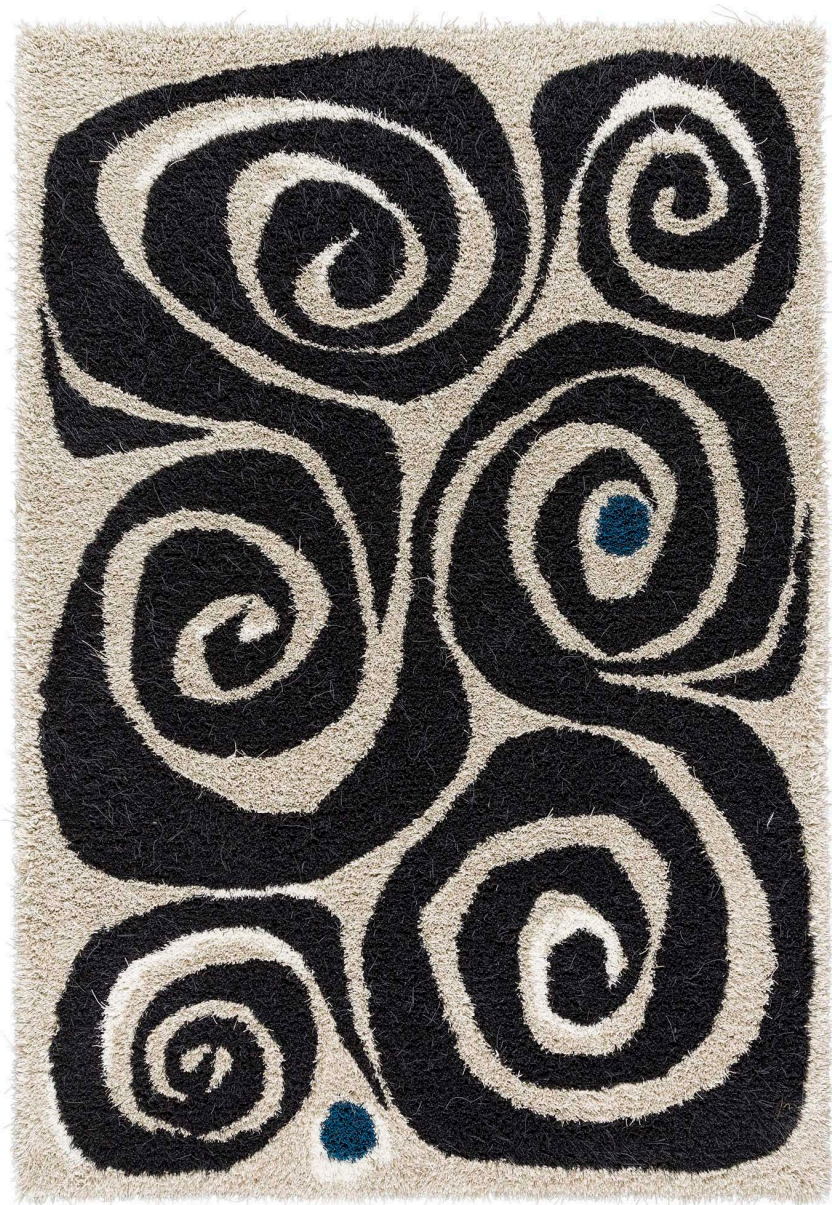
Rug 170x240 cm

Design ULLA ERICSON-ÅSTRÖM Hand tufted rug in pure wool and linen